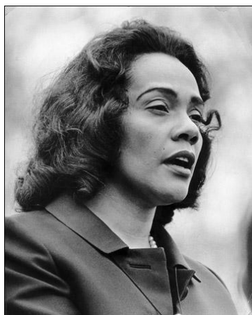
Coretta Scott King

May 12, 1968 - A 12-block Mother's Day march of "welfare mothers" is held in Washington, D.C., led by Coretta Scott King accompanied by Ethel Kennedy.